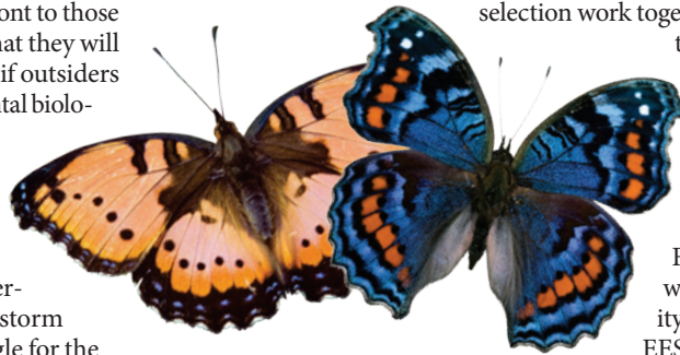
Plasticity: commodore butterflies emerge with different colours in dry (left) and wet seasons.

SET has long regarded inheritance mechanisms outside genes as special cases; human culture being the prime example. The EES explicitly recognizes that parent–offspring similarities result in part from parents reconstructing their own developmental environments for their offspring. ‘Extra-genetic inheritance’ includes PAGE 164 ▶